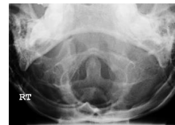
FUCH'S (IF NECESSARY)