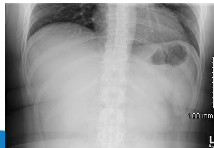
AP- LOWER RIBS