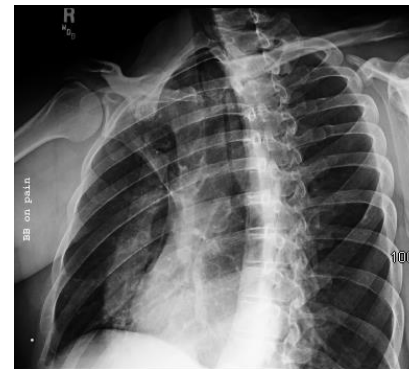
OBL- UPPPER RIBS