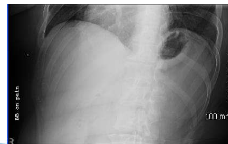
OBL- LOWER RIBS